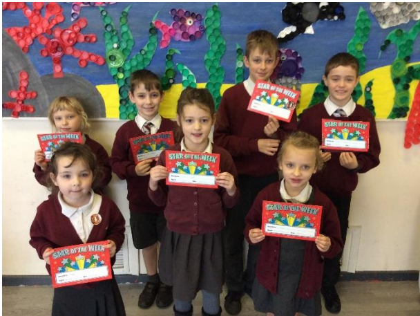
Our 'Stars of the Week' Well done to you all!

A letter has gone out on ParentMail regarding the setting up of a Parent Council. I hope this consultative group of parents will help shape some of the decisions we make to further enhance our provision at school. If you would like to be part of this group, please complete the reply slip on ParentMail/Forms.