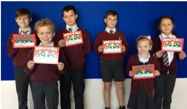
Our Stars of the Week Well done to you all!