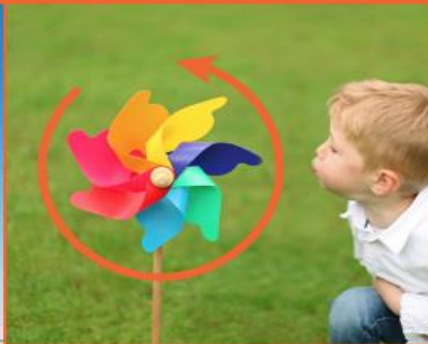
Rotary motion Movement in a circular motion.