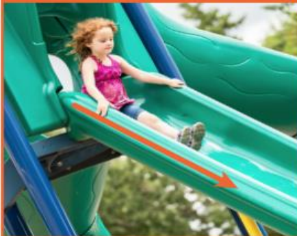
Linear motion Movement in a straight line in any one direction.