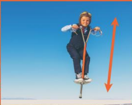
Reciprocating motion Movement in a straight line, back and forth, in any direction.