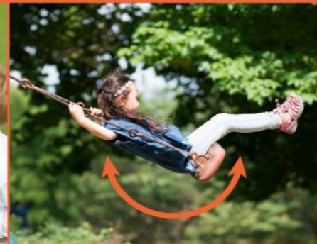
Oscillating motion Movement in a curve, back and forth.