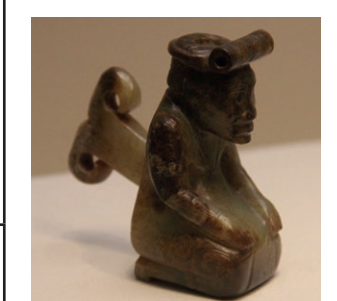
Jade figure found in the tomb of Fu Hao

The skeletons of six dogs and 16 humans were also found in the tomb. These were probably Fu Hao 's pets and advisers, sacrificed to accompany her into the afterlife.